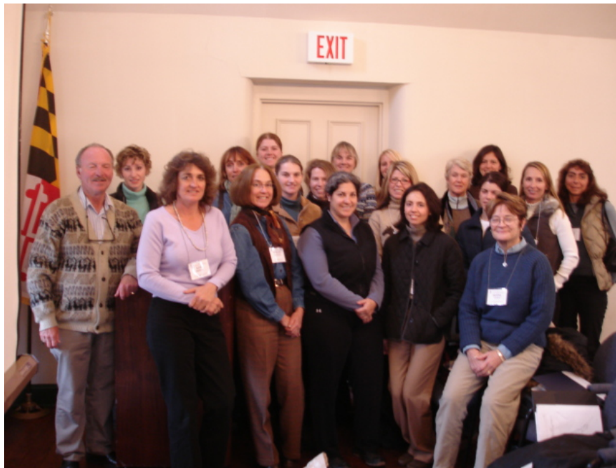
A Session Participants (not in order):